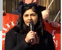
Zahra Sultana MP