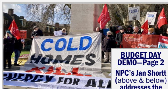
BUDGET DAY DEMO—Page 2

Energy firms were already able to charge £842m a year on bills for bad debt administration. The industry regulator Ofgem has now ruled they can charge an extra £735m (on average £28 per household per year). WTW – members of the End Fuel Poverty Coalition, along with the NPC – say the combined impact of these charges varies depending on the bill type with prepayment meter customers paying £25.17 per household per year. Direct debit customers pay £38.96 a year, while standard credit customers are hit hardest paying £129.71. The report says it is unclear if the extra payments will help reduce the accounts of struggling customers, or if they will be writ-